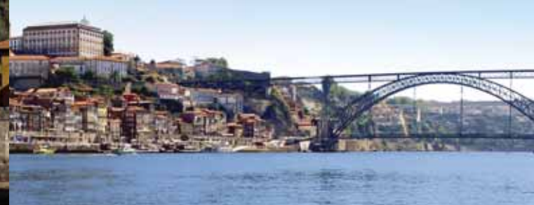
D. LUÍS I BRIDGE